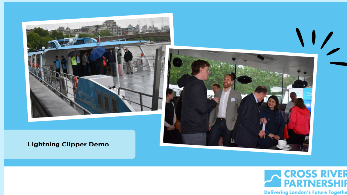
Lightning Clipper Demo