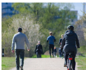
Seeking Participants for Clean Air Walking Routes research