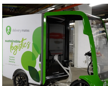
Halfway Point Review: Pimlico Micro Hub Logistics Trial