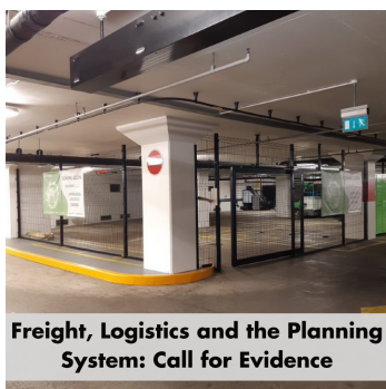
Freight, Logistics and the Planning System: Call for Evidence