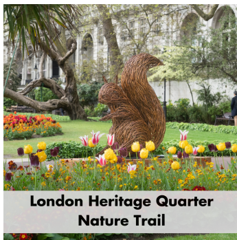
London Heritage Quarter Nature Trail