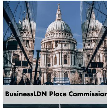
BusinessLDN Place Commission