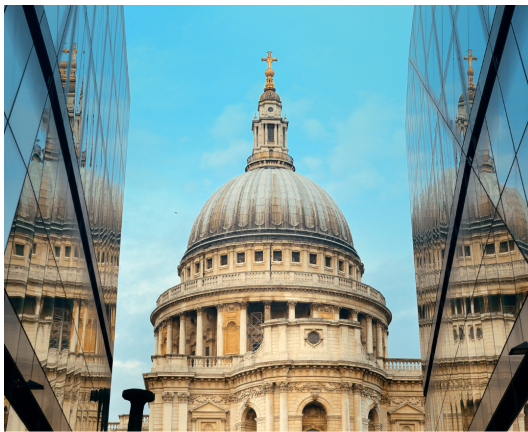
City of London Corporation Climate Action Dashboard