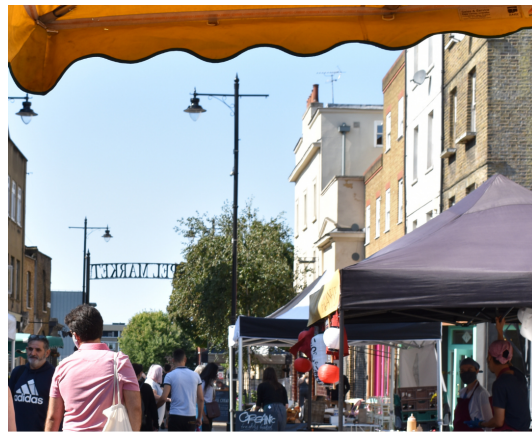
Clean Air Villages 4 Circular Economy Case Study