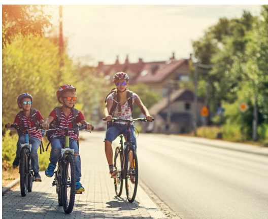
Cycle to School Week