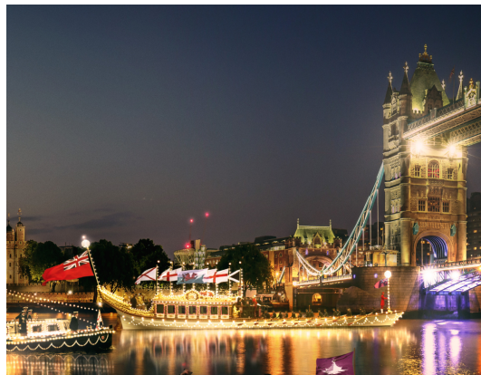
Totally Thames 2022