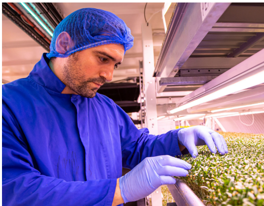
Zero Carbon Farms now on Clean Air Villages Directory