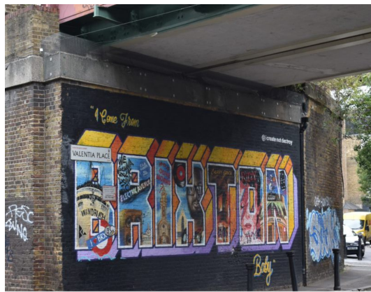
CAF Intervention – Micro Hub Trials