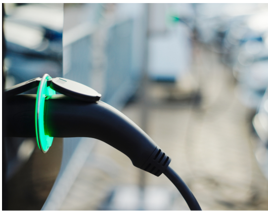
CALL Intervention: Electric Vehicles, Vessels and Infrastructure