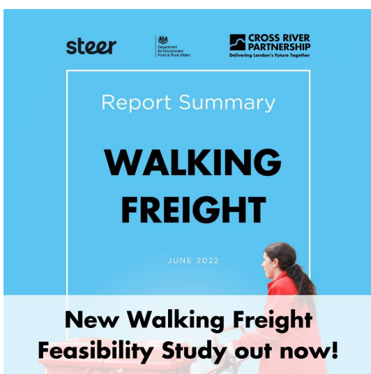
New Walking Freight Feasibility Study out now!