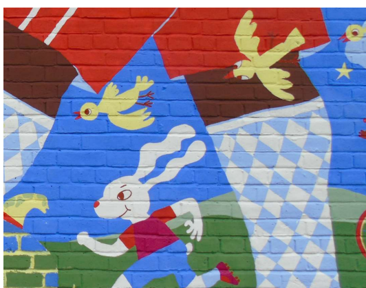
New Healthy Streets Everyday Mural at Cayley Primary