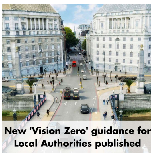
New 'Vision Zero' guidance for Local Authorities published