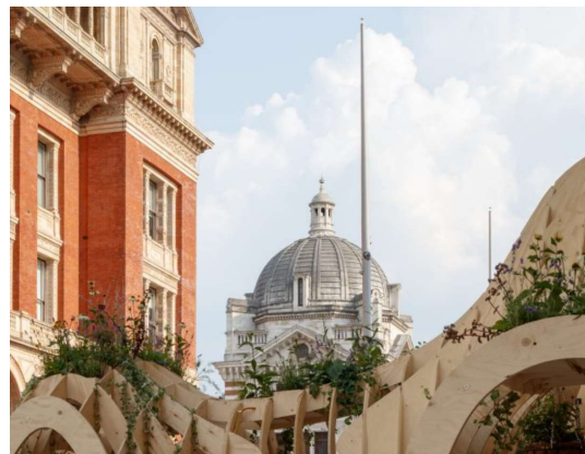
London Festival of Architecture 2022