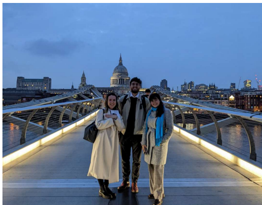
Millennium Bridge Celebrates its 20th Birthday