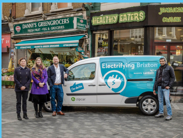
London's first shared electric van for local businesses