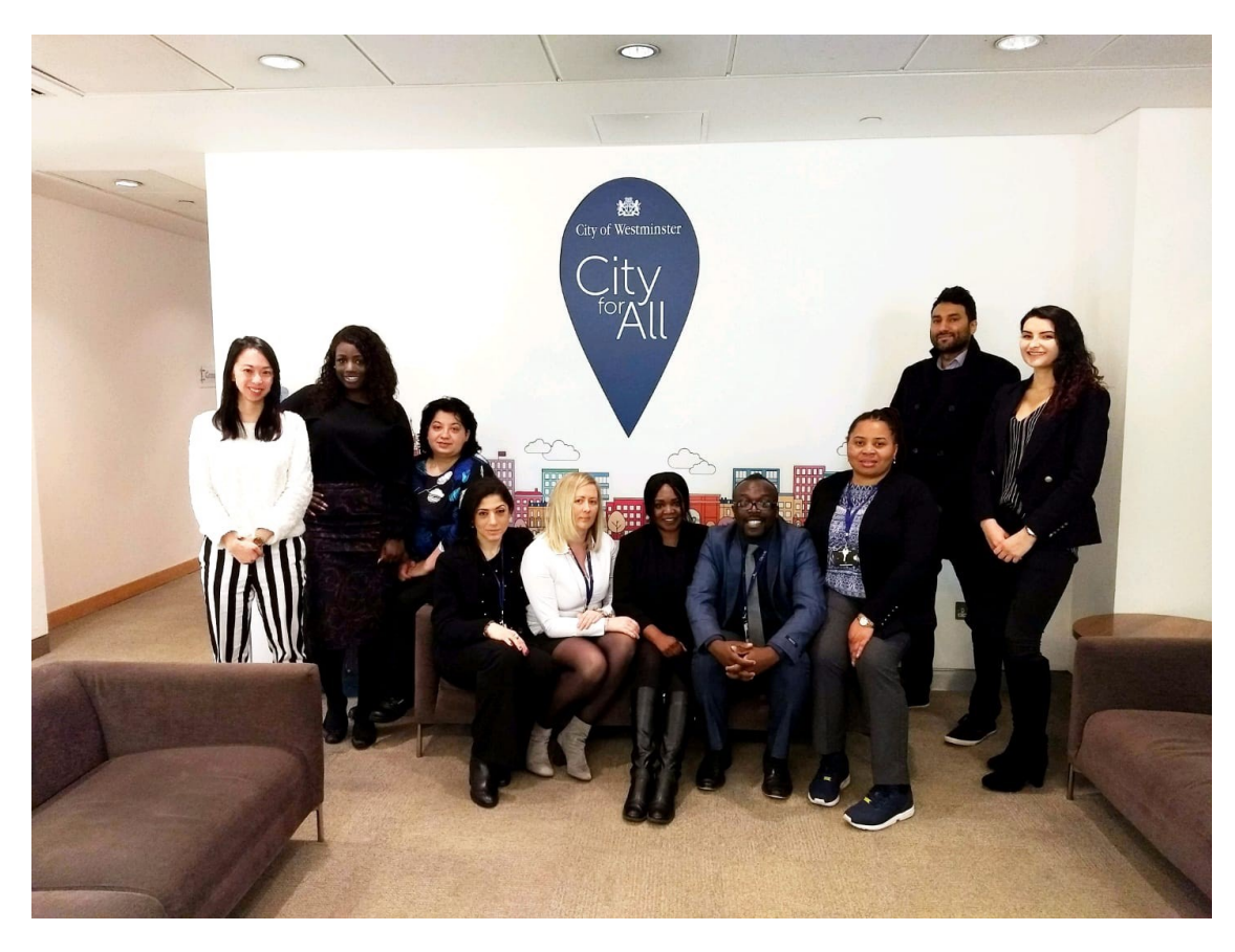
Recruit London supported 167 people from October to December 2018 and placed 73 into employment. We have been focusing on interim measures to get candidates ready for work by providing work trials and experience. Read more.