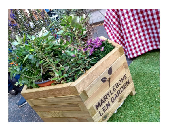
2019 is off to an exciting start for the Marylebone Low Emission Neighbourhood as construction has started on new measures to tackle air pollution in the area. Read more.