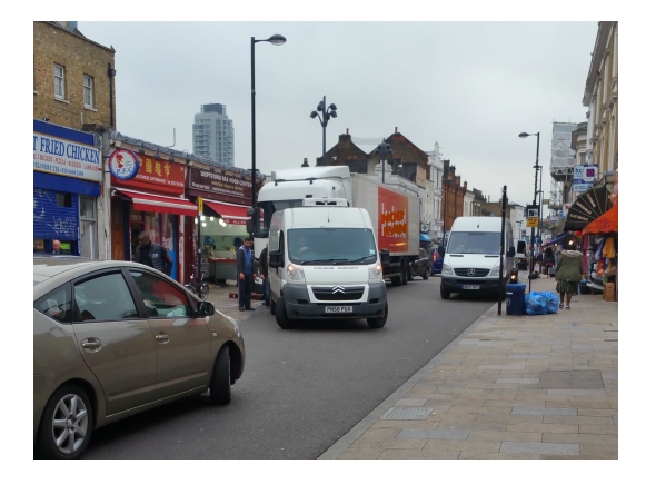
The <u>CAV</u> project has now met with all 5 partner boroughs to discuss recommendations for each village to reduce emissions from delivery and servicing in the area. <u>Read more</u>.