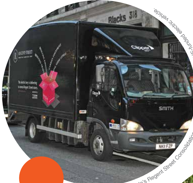
The Crown Estate's Regent Street Consolidation Centre is supported by a FLEVE-funded electric vehicle.