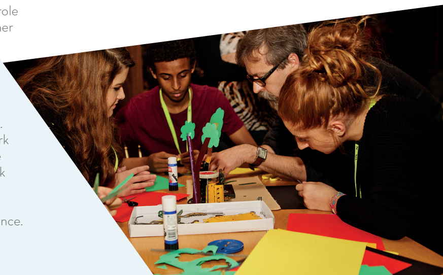
Photo: Creative Quarter an annual event coordinated by the Exhibition Road Cultural Group gives young people the opportunity to explore creative careers.

For more information, visit: www.discoversouthken.com/about-us